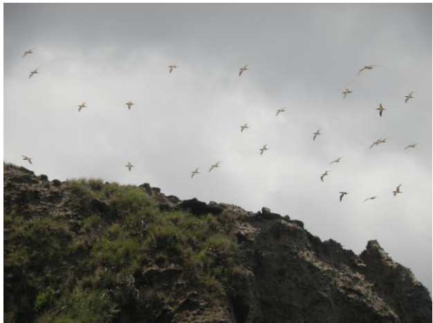
Flock of Brown Boobies take to the air from their perch on the Pointe Des Foux cliff face

The sea conditions and weather on that day were excellent, making for a most memorable trip. A dozen species of birds were observed during the 3-hour boat trip, and these included the Caribbean Martin (a Caribbean endemic), the white-tailed tropicbird and seven other species of seabird. Once again, the brown boobies in the colony on the Pointe Des Foux cliffs put on their usual display, rising on the air currents as the catamaran slowly approached. The Committee loaned participants on the trip some twenty (20) pairs of binoculars, and this certainly enhanced the quality of the experience on the trip.