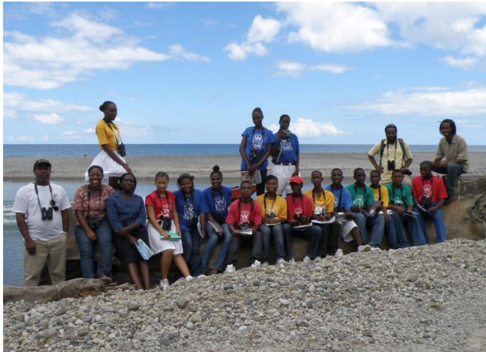
Students and Teachers of Nehemiah Comprehensive School pose for photo with Forestry Officers near Layou River mouth following birding activity

The following are the dates and locations where the birding activities with the various schools were conducted:-