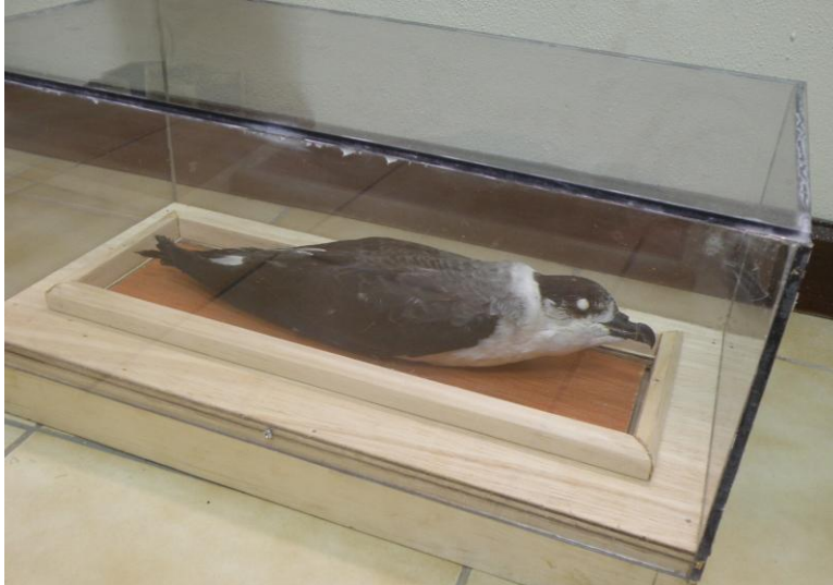
Skin of Diablotin bird, collected at Shawford near Trafalgar in May 2007, and which was displayed at the 2010 Public Presentation and the "Know Your Birds" Workshop