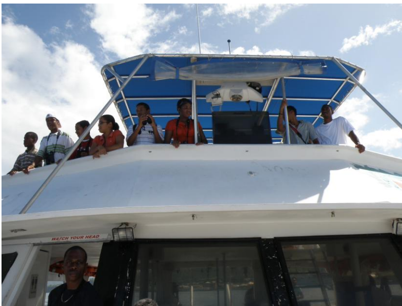
Some of participants on Boat trip moments after pulling off the dock, en route to Pointe Des Foux to view sea birds

activity, which was the sixth such field visit on the annual CEBF programme in Dominica.