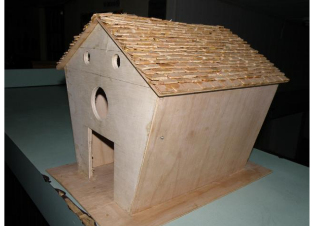
Bird House built by GSS Woodwork Students

BirdART III was somewhat different from its two "predecessors", in that there was not a stand-alone bird-art exhibition per se . Rather, the mounted art pieces produced for the event were displayed as a component of the school's Annual Curriculum and Art Exhibition. The latter was held in the foyer of the Arawak House of Culture in Roseau, on Friday 14 th May 2010.