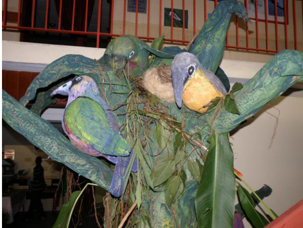
Papier-marché presentation with birds and nests

CEBF 2010 saw the third "edition" of BirdART , an activity where students create art pieces depicting or on the theme of birds. This year, the Goodwill Secondary School was invited to undertake this activity, and was the first secondary school among the three schools to have produced BirdART to date; the expose was first held in 2007.