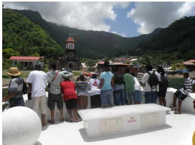
Boat trip participants enjoy view of Soufriere R.C. Church and village while returning from viewing birds

En route to Pointe Des Foux, the group sighted a school of squid, and on the return journey, the captain travelled near-shore in the Soufriere-Scotts Head Marine Reserve, where we spotted turtles on two occasions. We also observed the bubbling from the seabed just in front of the Soufriere Roman Catholic Church, and seized the opportunity to photograph a brown booby perched on a buoy, as well as a brown pelican preening itself on a rock in Soufriere Bay.