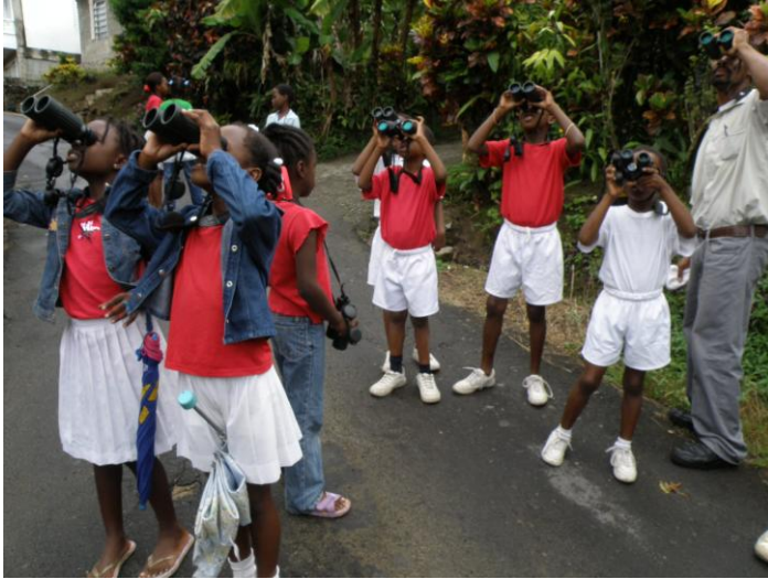
Students and Teacher of Wotten Waven School take a closer look at some birds while walking up the Wotten Waven Road

It must be noted that although CEBF takes place in the official dry season, for 2010 rain affected two (2) of the five birding field activities. Although the particular activities were not rained out, it rained at the start of the Birding By The Boulevard with the Pierre Charles Secondary School, and during Birding By the Glo Cho with the Wotten Waven School for the last of the five field activities with schools. However, the weather, did not dampen the enthusiasm of the students.