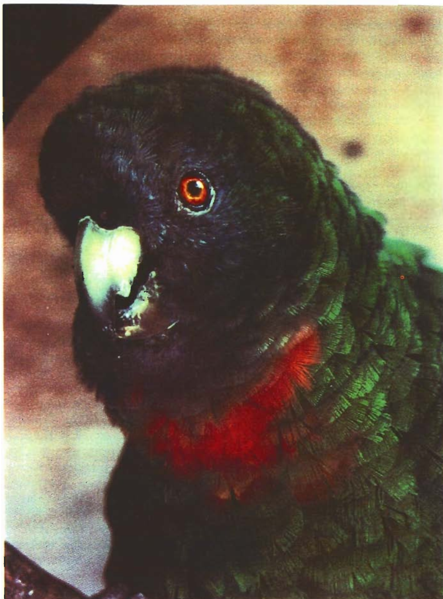
Dominica's second threatened amazon Parrot, the Red-necked or Jaco Parrot. Photo taken at Parrot Aviary, Roseau, Dominica.

Sisserous were observed directly over the period 25 March-6 June 1999 from a lookout point ~100 m from a Chataignier ( Sloanea caribaea ) nest tree located on the southwest slope of Morne Diablotin. Notes taken during