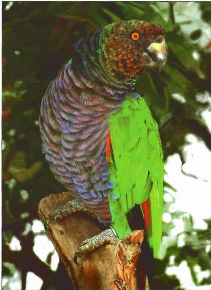
Female Sisserou ( Amazona imperialis ).

Recently, the parrot team engaged in a series of field surveys that punctuate the importance of Dominica's aggressive, comprehensive forest conservation policies. During the 2000 and 2001 field seasons, the team began applying Global Positioning System (GPS) and Geographic Information System (GIS) technologies to parrot monitoring efforts, initiated with support from a U.S. Fish and Wildlife Service GPS training grant and a Loro Parque Fundação grant (for population surveys) to RSCF. Although the Forestry Division has been engaged continuously in parrot monitoring since 1981, efficient methods to quantify the spatial distribution and abundance of parrots have proven elusive. Rough terrain, dense forest canopy and inaccurate topographic maps have thwarted a comprehensive assessment of habitat utilization by both parrot species. The Sisserou ( A. imperialis ) has been of tremendous conservation concern for decades, but especially since hurricane David in 1979, which