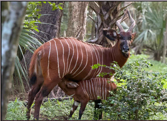
To date, RSCF has returned 35 critically endangered mountain bongo to Kenya.