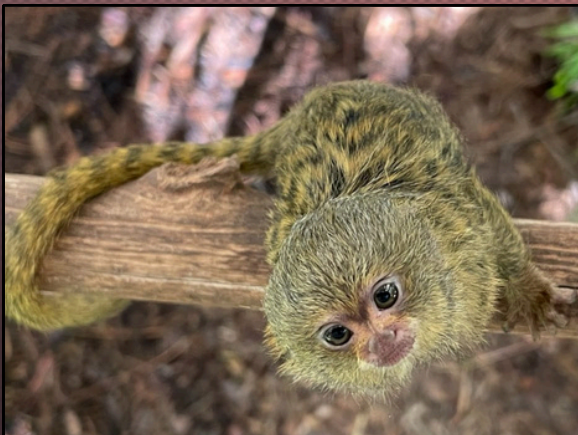
RSCF is home to the largest captive colony of pygmy marmosets in North America.