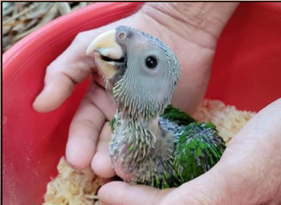
RSCF houses the only red-browed Amazon colony in North America.